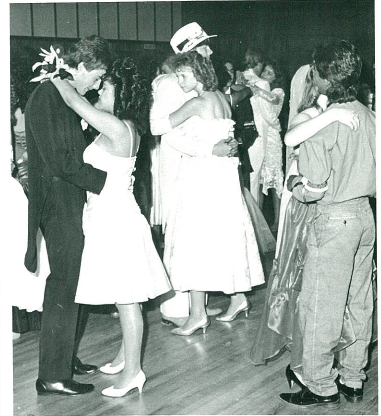
As the night came to a close, slow dances were much more prevalent.